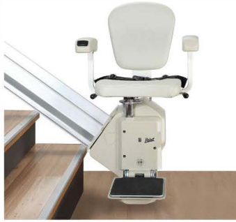
Manual Swivel Seat 0° / 45° / 90°