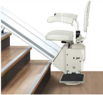
* Optional Powered Swivel Seat