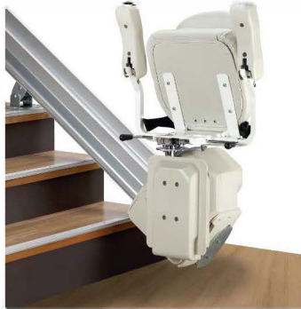
Foldable Seat / Foot Rest / Armrests